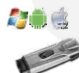
CONNEX SMART TO BE COMBINED WITH PC (*) OR TABLET (**): EOBD CONNECTION VIA BLUETOOTH®

TECHNICAL SPECIFICATIONS: SEE TECHNICAL DATA SHEET