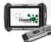
CONNEX BT STAND ALONE EOBD CONNECTION VIA BLUETOOTH®