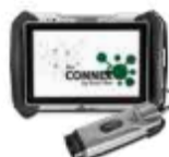
CONNEX STAND ALONE EOBD CONNECTION VIA CABLE