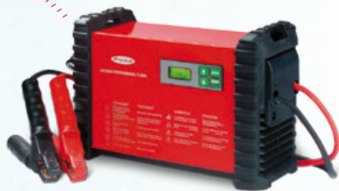
ACCTIVA PROFESSIONAL FLASH 70A