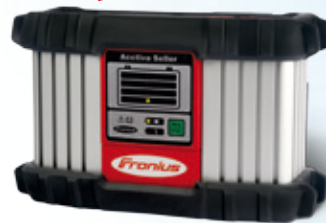
ACCTIVA SELLER 30A